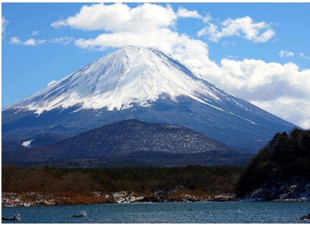
- Mount Fuji